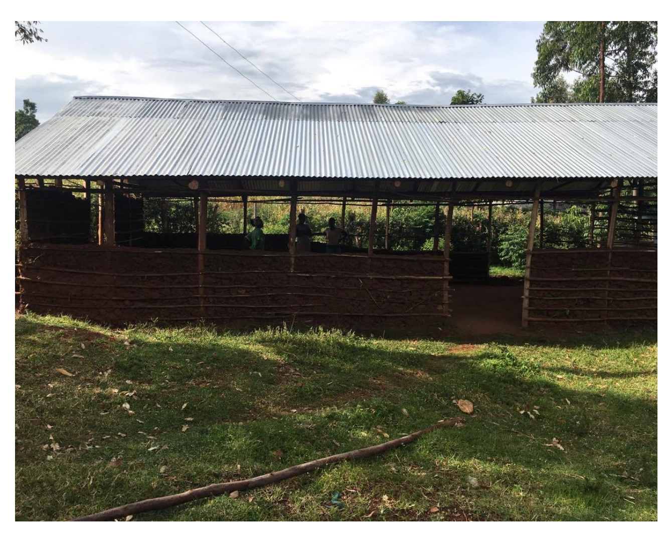
As you continue to faithfully pray and support, Abiding Above Ministries has been able to build in Africa our second simple local church structure.

As you continue to faithfully pray and support, Abiding Above Ministries has been able to build in Africa our second simple local church structure. For each church building, the pastor has been trained in how to lead God's people to disciple others and train them how to become disciple makers. We also have 7 churches meeting together in homes. Let's continue to help these African pastors and people, and at the same time, let's pray for our churches in America. There will be more people crowded into these new buildings on a Sunday morning there, than in many of our churches across our beloved America. Everyone agrees, the Lord must come first in our lives and local churches.