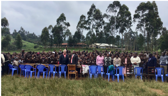
Large School in Nairobi, Kenya - Many of these students prayed to receive Jesus Christ

I have a lot more traveling and preaching to do, including a Christian Leadership Seminar, and a Pastors' Conference, in the coastal region of the Indian Ocean. I will have to share Part 2 in our next newsletter.