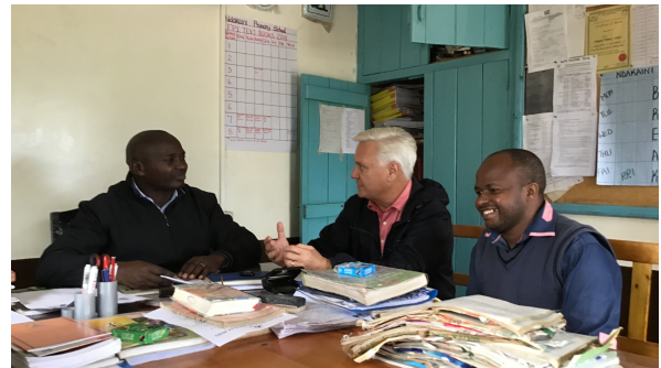
Setting up a Bible Lesson System with Principals of Nairobi Schools