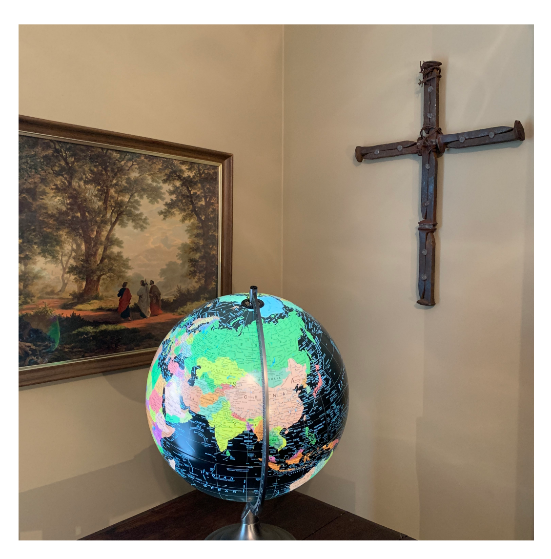
"Go and make disciples to the nations ..."