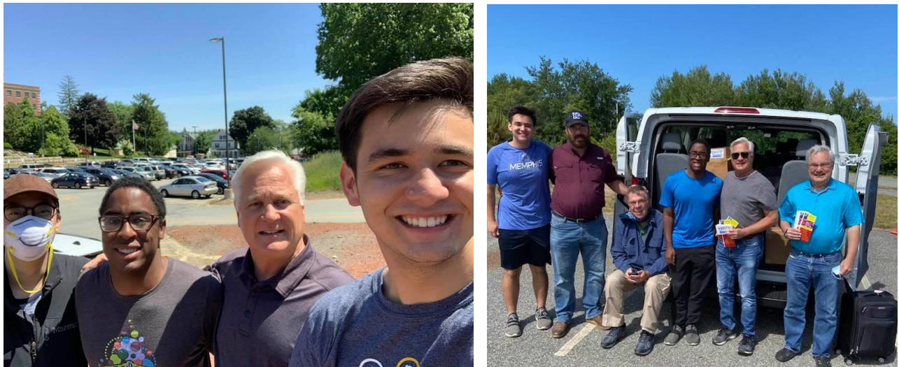
A team of men blitzed highly populated areas of towns and cities in these states: Rhode Island, Connecticut, Massachusetts, Maine, New Hampshire, New Jersey, and New York.

Praise the Lord! In spite of twice postponing our evangelism trip because of the coronavirus, we finally made it to the northeast part of the United States with great success!