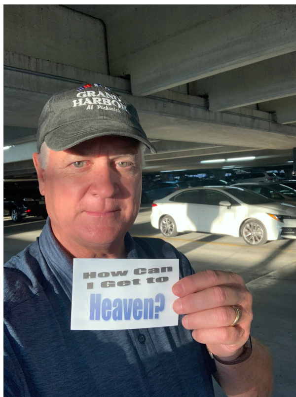
Paper Missionaries (Our Tract - How Can I Get To Heaven)

As you have read our past newsletters, a group of guys and I have done evangelism by distributing thousands of tracts in the northeastern parts of the United States. These are areas statistically shown to be largely without Christ. We are planning to do this in Austin, TX in the near future. We have also been doing the same here in the Memphis, TN area. We take these simple gospel tracts and hand them directly to the people or we place them in the door handle on the driver’s side of the vehicle. It works, my friend! Write to us and we can send you tracts and you can do the same as you go about your city.