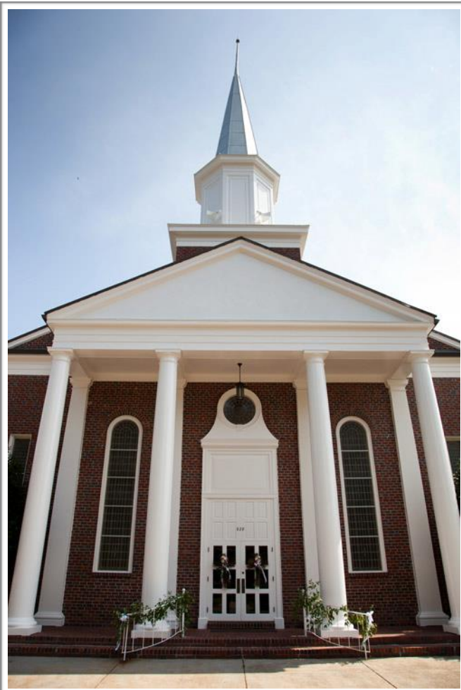
Oakhurst Baptist Church Clarksdale, MS.

Hebrews 10:23–24 – “Let us hold fast the confession of our hope without wavering, for He who promised is faithful; and let us consider how to stimulate one another to love and good deeds ...”