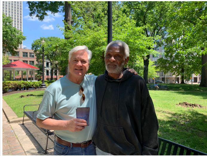
Tract Distribution Downtown Memphis, TN. Saved and sure!

Earlier this year we have had great success in handing out thousands of gospel tracts.