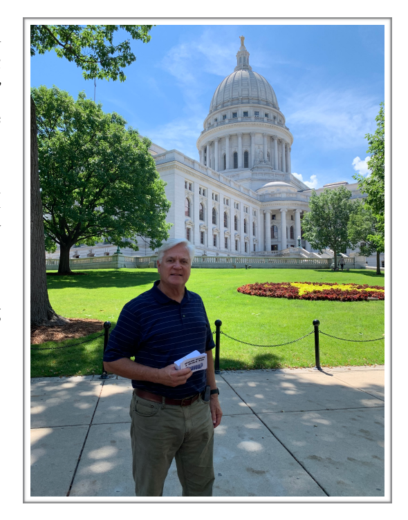
President Abiding Above Ministries Colossians 3:1-3 AbidingAbove.org