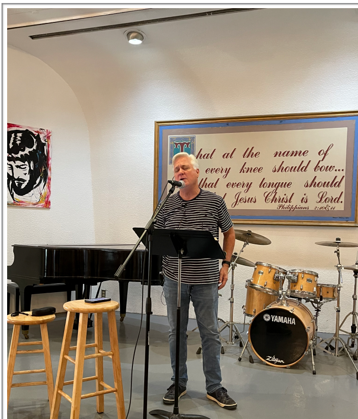
Closing the message with a gospel plea and leading in the sinners prayer.

God loves you and so do we! Thank you for praying and for sharing what God has given you.