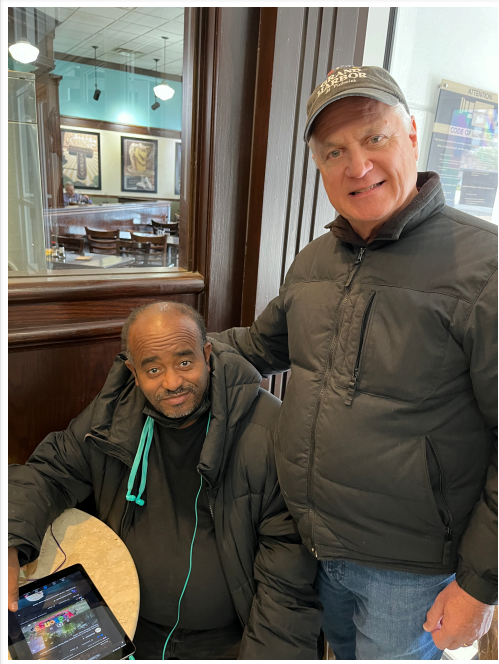
Prayed to receive Christ with us.