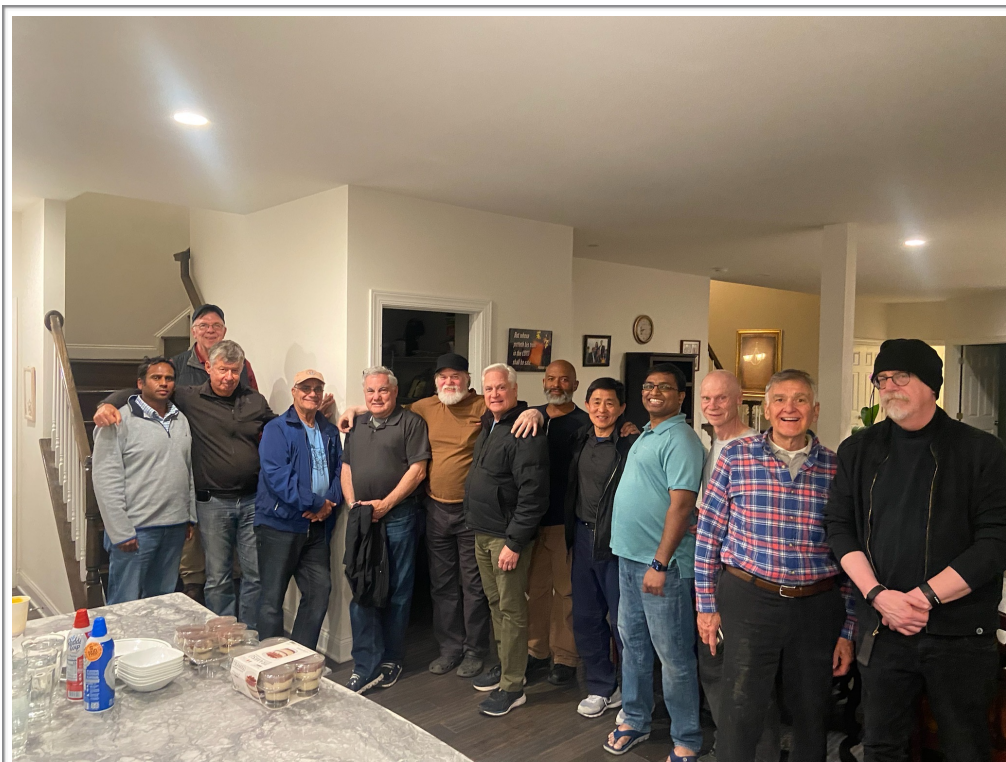
Part of our team of 18 men. Sowers for our Lord and Savior Jesus Christ.

People who are without Christ. People who need the Lord. People who need to be born again, born from above as Jesus explained to Nicodemus.