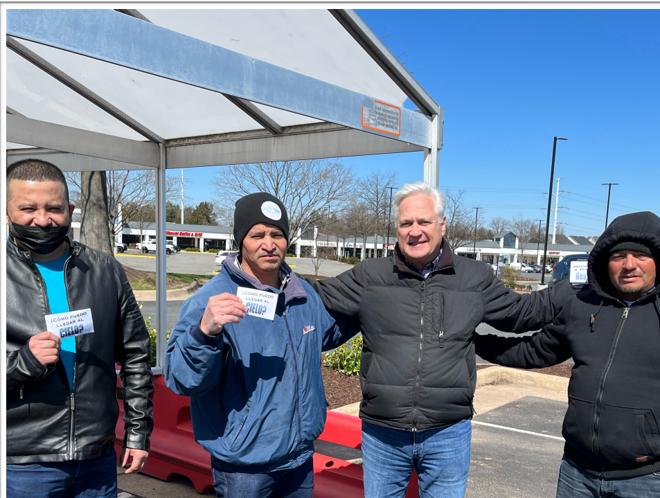
These men completely read the new Spanish version of our tract, "How Can I Get To Heaven?"