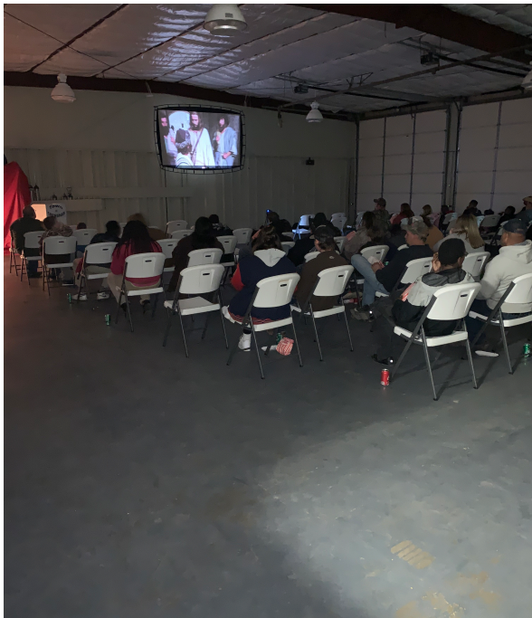
Presenting the Jesus Film to the people in America's small towns.

Presenting the Jesus Film in the towns of America and Kenya,