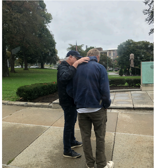
Presenting the gospel to the people of New York

Presenting the Jesus Film in the towns of America and Kenya,