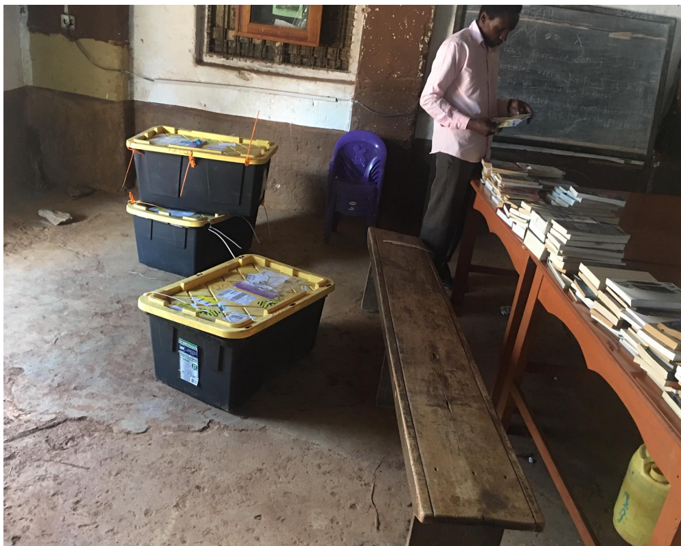
Over 300 pounds of conservative books on theology arrive in Kissii, Kenya

They finally arrived! If you will remember in our June newsletter, we shared a picture of 300 pounds of conservative books on theology. A special family donated these books to our key leaders and pastors in Kisii, Kenya, Africa. They were from the library of their loved one who is now in heaven. We shipped the books with FedEx, so we knew everything was in order, but the books got held up in customs in Nairobi, Kenya, the capital city. Over the years, we have learned that in foreign countries they are quick to cull out shipments to investigate them so that the items will not be sold in the country without payment of a governmental tax. On top of this, we learned that someone had altered paperwork and piggybacked on our shipment to avoid paying shipping costs for their fertilizer. It's been frustrating to say the least! But, when I think of all the Apostle Paul went through on his missionary journeys, the frustration we experienced was not hard at all.